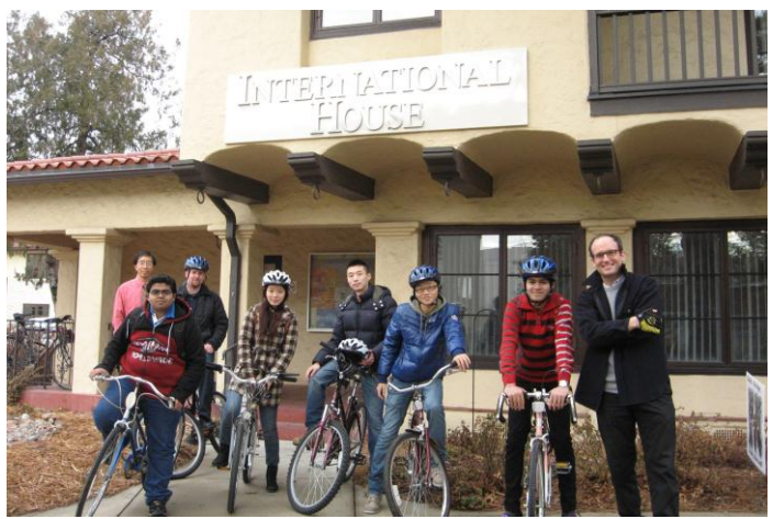
International students enjoying the bike-share program.

Washburn University's very own bike-share program, Bods on Bikes, has seen enormous enthusiasm at the start of the 2013 spring semester. At the end of the 2012 fall semester, the program had a total of 14 bicycles, five of which were donated by the Topeka